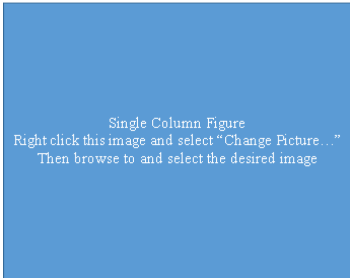
Fig. #. This is an example of a single column figure. <Caption goes here. Paste in caption, select text and then use the “Figure Caption” Style. Ensure both Figure and Caption are set to “Top and Bottom” wrapping, and are set to “Fix position on page”>

This is normal text after the subheading.